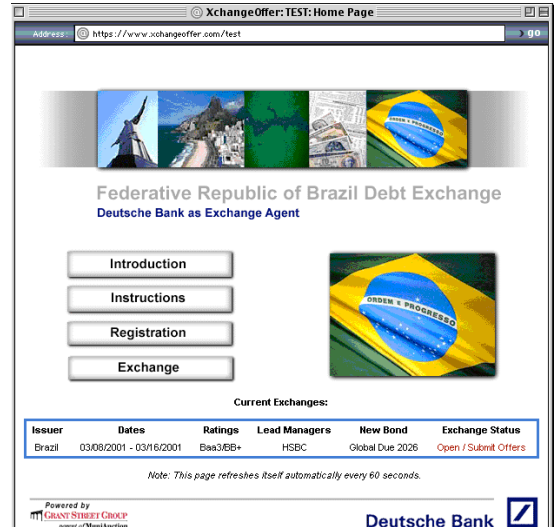
Customized Exchange Offer Home Page →

Deutsche Bank uses a new web site created, hosted and maintained by Grant Street Group to perform its duties as exchange agent in sovereign debt exchange offers.